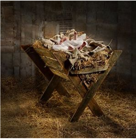
First coming to Bethlehem in a manger.