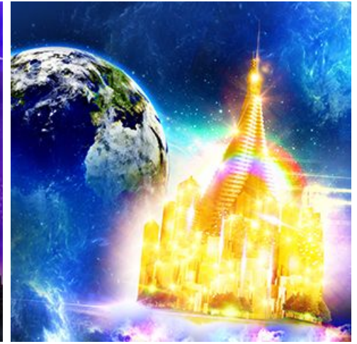
Third coming with the holy city and all righteous people at the close of the 1,000 years.