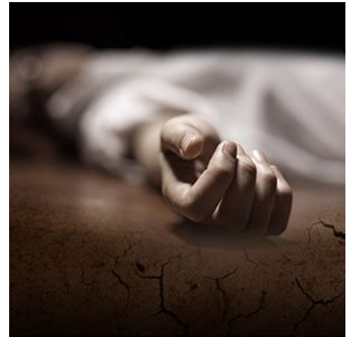
The wicked will lay dead upon the earth during the 1,000 years.

the earth. The righteous will all be in heaven. All the wicked will be laying dead upon the earth. Revelation 22:11, 12 makes it clear that the case of every person is closed before Jesus returns. Those who wait to accept Christ until the 1,000 years begin will have waited too long.