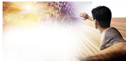
The living wicked will be slain by the brightness of Jesus' second coming.

“The rest of the dead did not live again until the thousand years were finished” (Revelation 20:5)