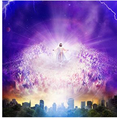
Second coming in the clouds at the beginning of the 1,000 years to take His people to heaven.