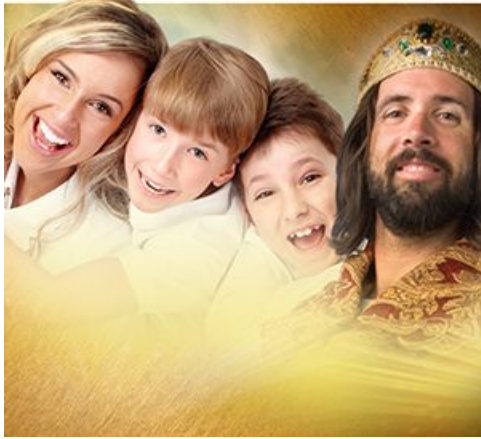
The righteous will be in heaven with Jesus during the 1,000 years.

When an angel appeared at Jesus' tomb, the entire group of Roman guards fell as dead men (Matthew 28:2, 4). When the brightness of all the angels, God the Father, and God the Son combine, the unsaved will die as if hit by lightning. The wicked already dead when Jesus returns will remain in their graves until the end of the 1,000 years.