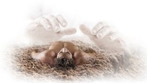
Adam was created by God in the beginning.

Answer: God made us from dust in the beginning.