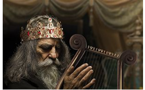
The Bible suggests that King David will be in God's kingdom, but that he is in his grave now, where he awaits the resurrection.