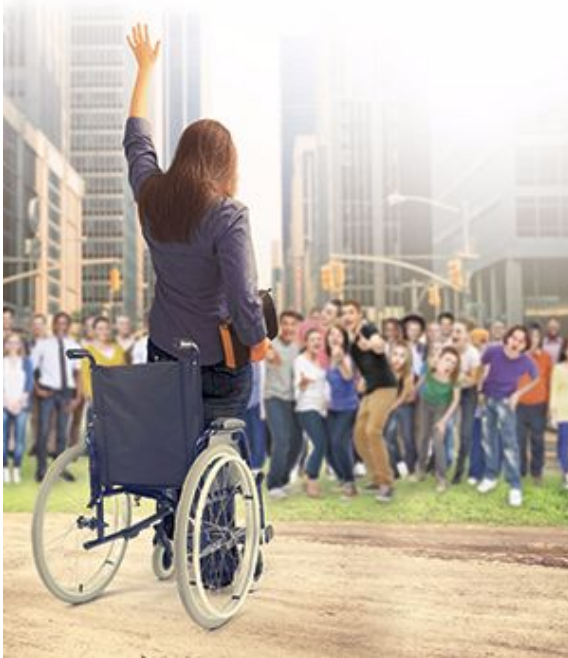
All miracle working is not from God, because devils also work miracles.

Answer: Yes indeed! Devils work incredibly convincing miracles (Revelation 13:13, 14). Satan will appear as an angel of light (2 Corinthians 11:14) and, even more shocking, as Christ Himself (Matthew 24:23, 24). The universal feeling will be that Christ and His angels are leading out in a fantastic worldwide revival. The entire emphasis will seem so spiritual and be so supernatural that only God's elect will not be deceived.