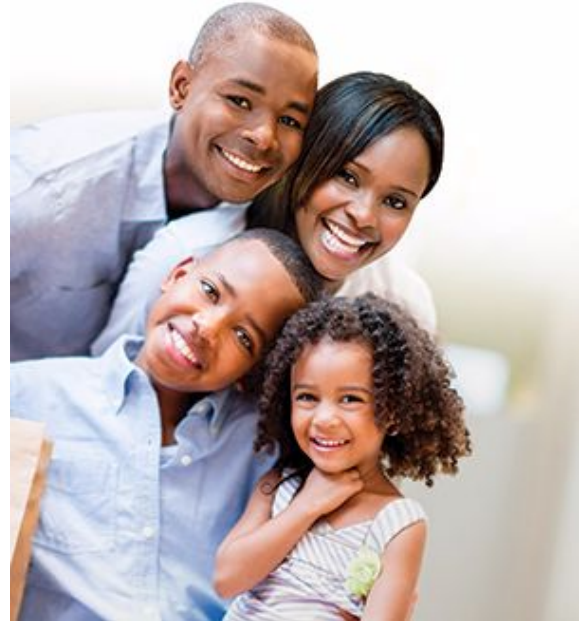
These four people are four souls.

Answer: A soul is a living being. A soul is always a combination of two things: body plus breath. A soul cannot exist unless body and breath are combined. God’s Word teaches that we are souls—not that we have souls.