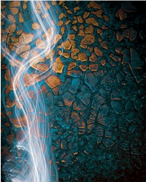
Body(Dust) - Breath(Spirit) = Death (No Soul)

an undying, immortal soul is not found in the Bible, which teaches that souls are subject to death.