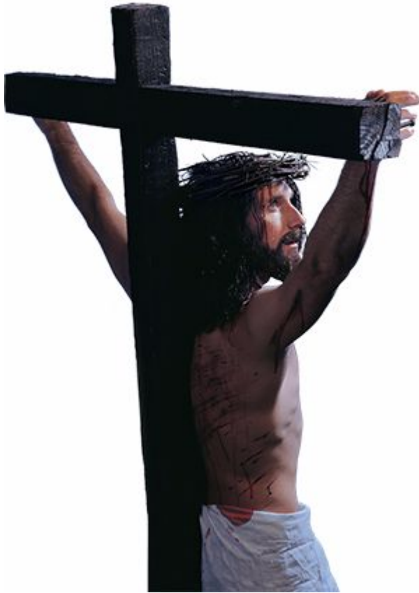
Jesus made the destruction of sin possible.

Second , sin will be purged from the universe by the permanent destruction of all those who choose it: the devil, the demons, and people who have followed them. God's Word is clear on this point; sin will never again arise to harm His creation or His people.