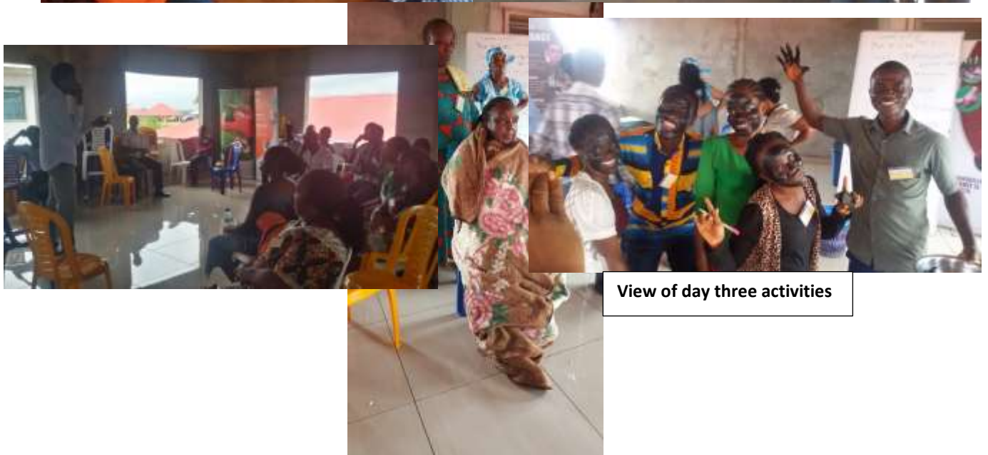
View of day three activities