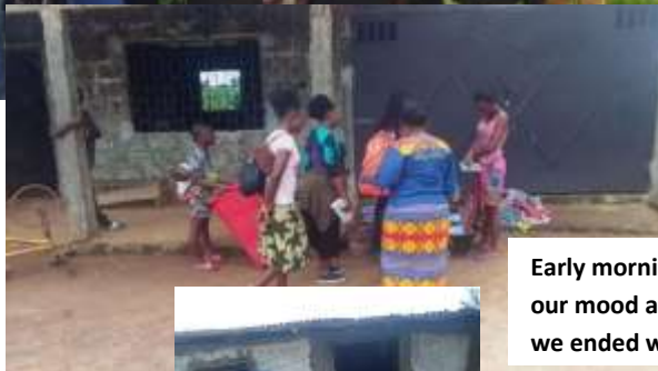
Early morning moon brightened our mood and day's training as we ended with a Bible study