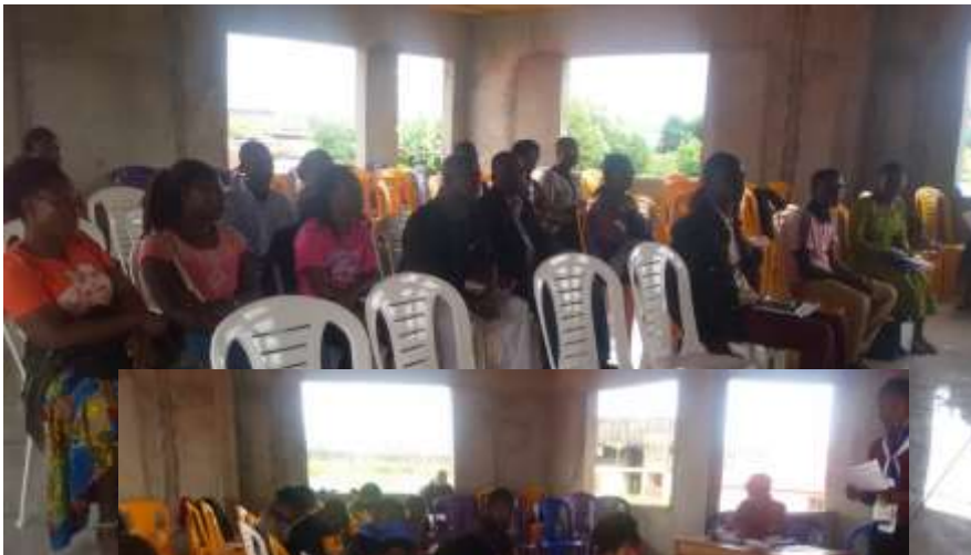
View of day one training