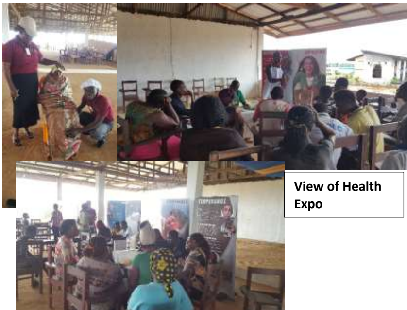
View of Health Expo

Exercise of faith was the campers' morning manna on day five. God divine favor and protection was display as participants were forced to intercede for a colleague from 5:00AM to 7:00AM. God intervened and the rest of the day's activities implemented. The much publicized health Expo was conducted with 68 community members benefiting from health advices and healing. During the health expo, 10 stations were set up, starting from registration through to books sale. The health Expo went well with full support from the health ministries department of the South West Liberia Conference of Seventh-day Adventist. NEWSTART materials and other health kits were provided. Participants were challenged and motivated to do more.