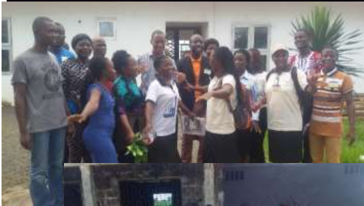
The joy of being a help. Community visit went well