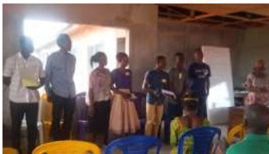
WAMMM elected officers