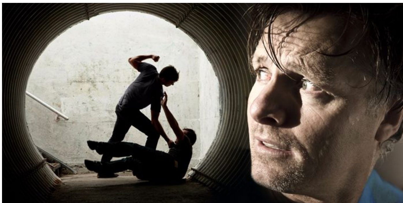
All who choose not to follow Christ will finally be destroyed with the sin they love

Answer: God will not destroy sin until everyone has been fully convinced of His justice, love, and mercy. All will finally realize that God, by asking for obedience, is not trying to force His will upon us, but rather is trying to keep us from hurting and destroying ourselves. The problem of sin is not settled until even the most cynical, hardened sinners are convinced of God’s love and confess that He is just. It will take, perhaps, a major catastrophe to convince some, but the horrible results of sinful living will finally convince all that God is just and right.