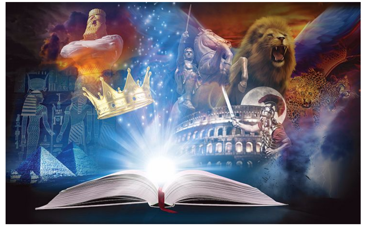
Before Cyrus was born, God's Bible prophet named him as the general who would overthrow Babylon.

Answer: Bible predictions of future events that have come to pass dramatically confirm the divine inspiration of Scripture. These are just a few examples of fulfilled Bible prophecies: