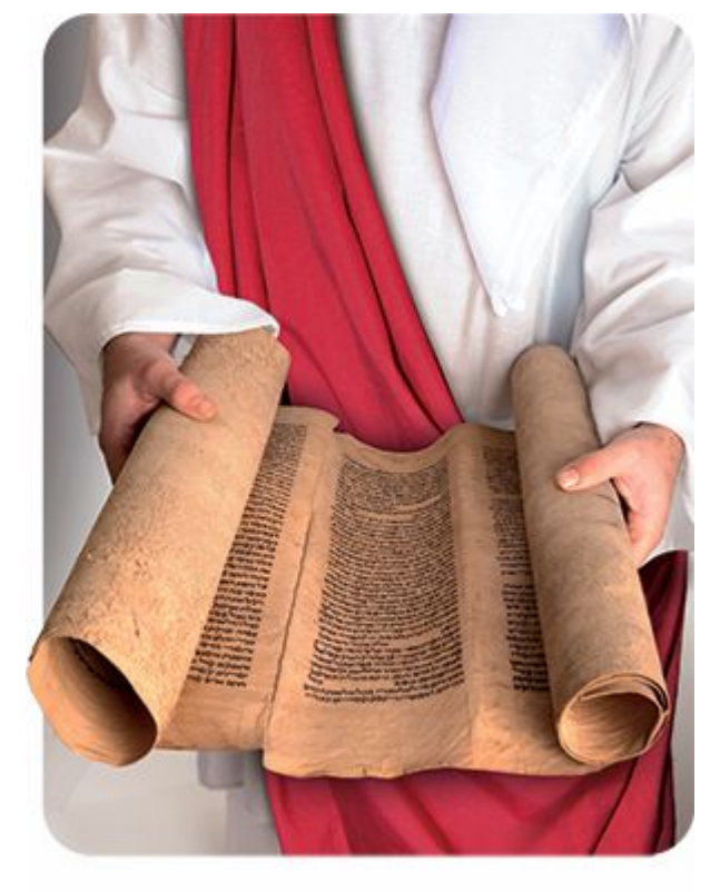
Jesus quoted the Bible and stated that it was true.

worship the Lord your God, and Him only you shall serve' " (Matthew 4:4, 7, 10).