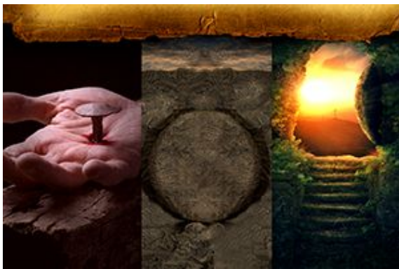
When I am baptized, I affirm my belief in Jesus' death, burial, and resurrection.