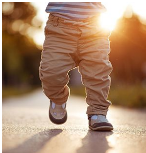
New Christians are like toddlers learning to walk. They sometimes slip and fall.

Answer: This is like saying a baby should never try to walk until certain she will never slip and fall. A Christian is a newborn “baby” in Christ. This is why the experience of conversion is called “being born again.” A person’s sinful past is forgiven and forgotten by God at conversion. And baptism symbolizes the burial of the desires of that old life. We begin the Christian life as babies, rather than adults, and God judges us on our attitude and the trend of our lives, rather than on a few slips and falls that we may experience as immature Christians.