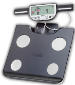
BC-601 ( HTTPS://TANITA.EU/BC-601 )