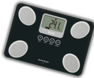
BC-731 ( HTTPS://TANITA.EU/BC-731 )