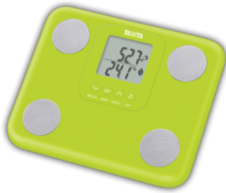
BC-730 ( HTTPS://TANITA.EU/BC-730 )