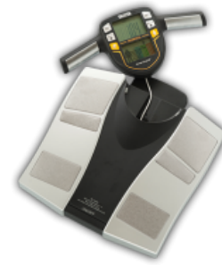
BC-545N ( HTTPS://TANITA.EU/BC-545N )