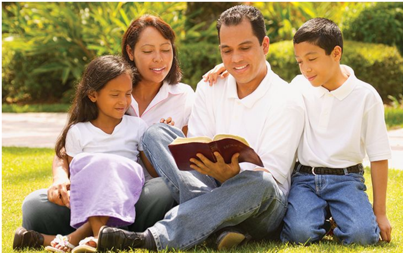
With Christ in your hearts and home, marriage will be successful.