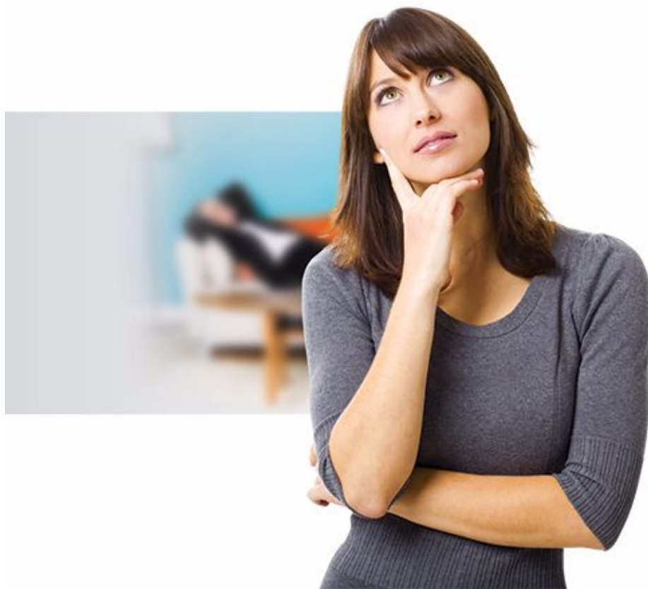
The wrong kind of thinking can destroy your marriage.

are possible” (Matthew 19:26). Don’t despair. God’s Spirit can change your heart and your spouse’s heart if you will ask and let Him.