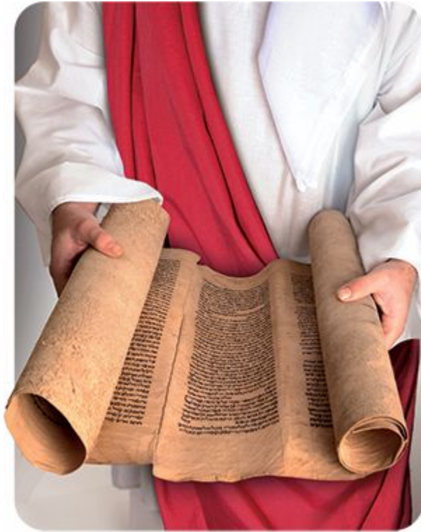
Jesus quoted the Bible and stated that it was true.

worship the Lord your God, and Him only you shall serve' ” (Matthew 4:4, 7, 10).